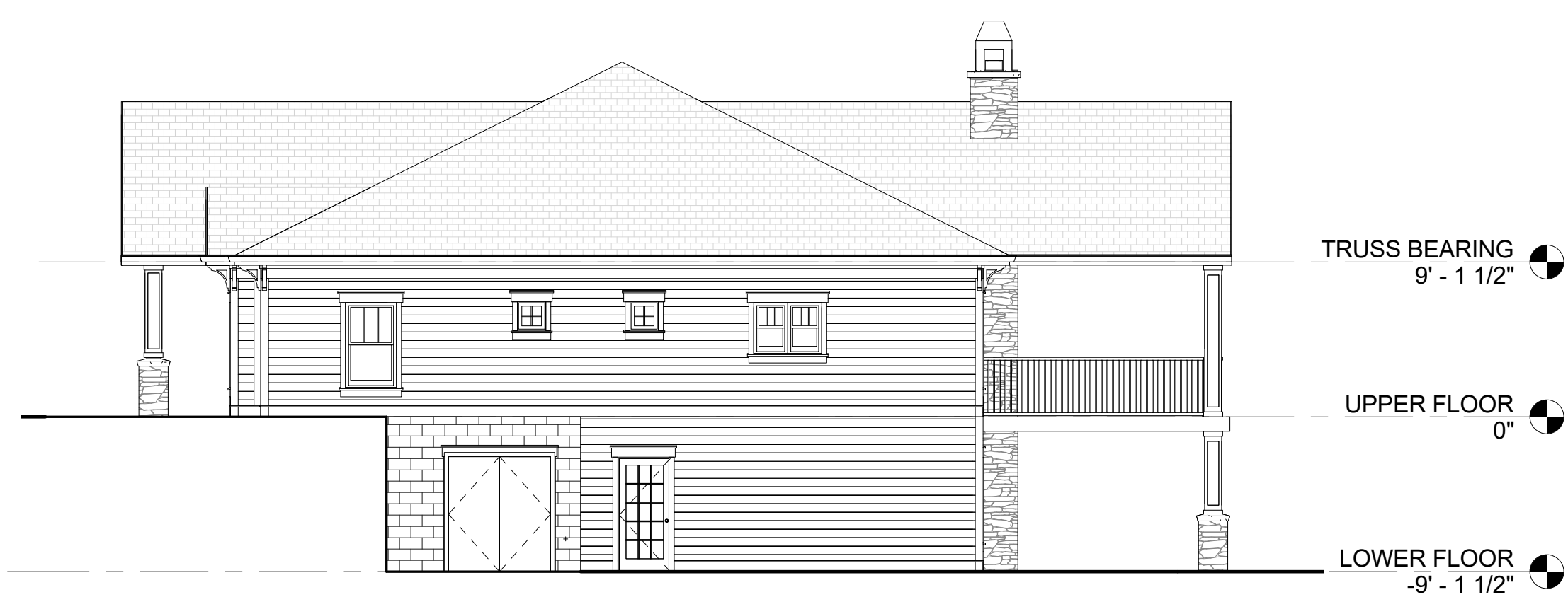
3 RIGHT-SIDE ELEVATION SCALE 1/8" = 1'-0"