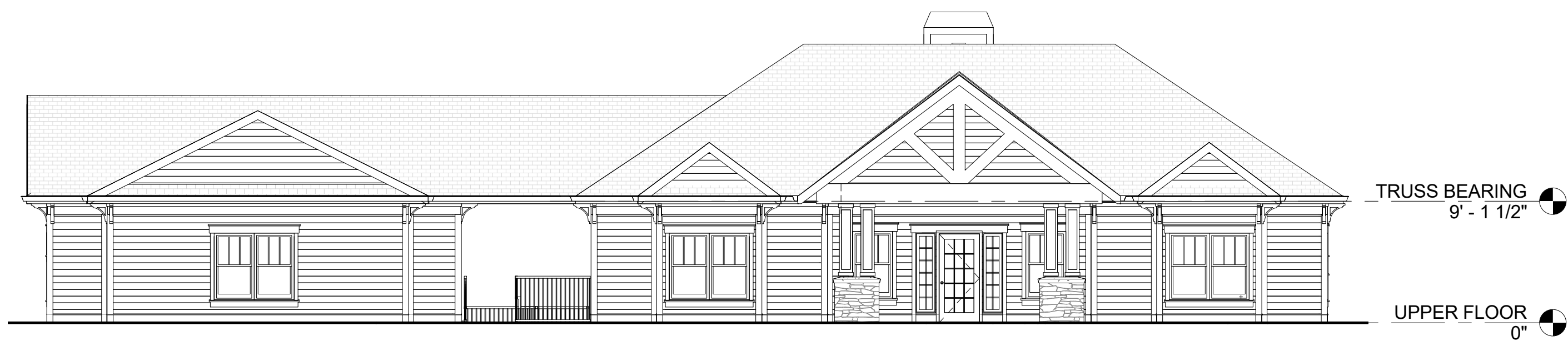
1 FRONT ELEVATION SCALE 1/8" = 1'-0"