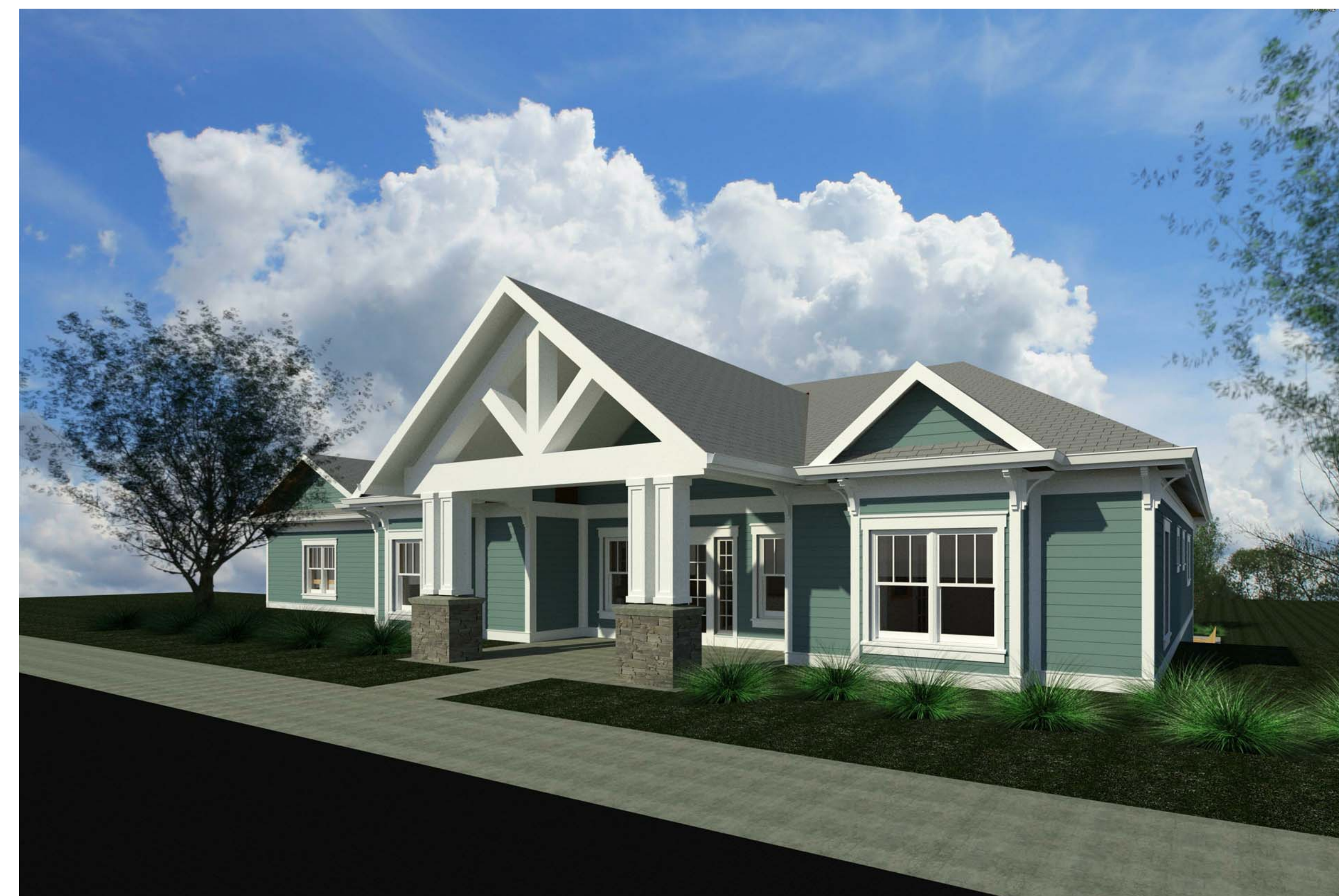
5 FRONT PERSPECTIVE SCALE 1/2" = 1'-0"