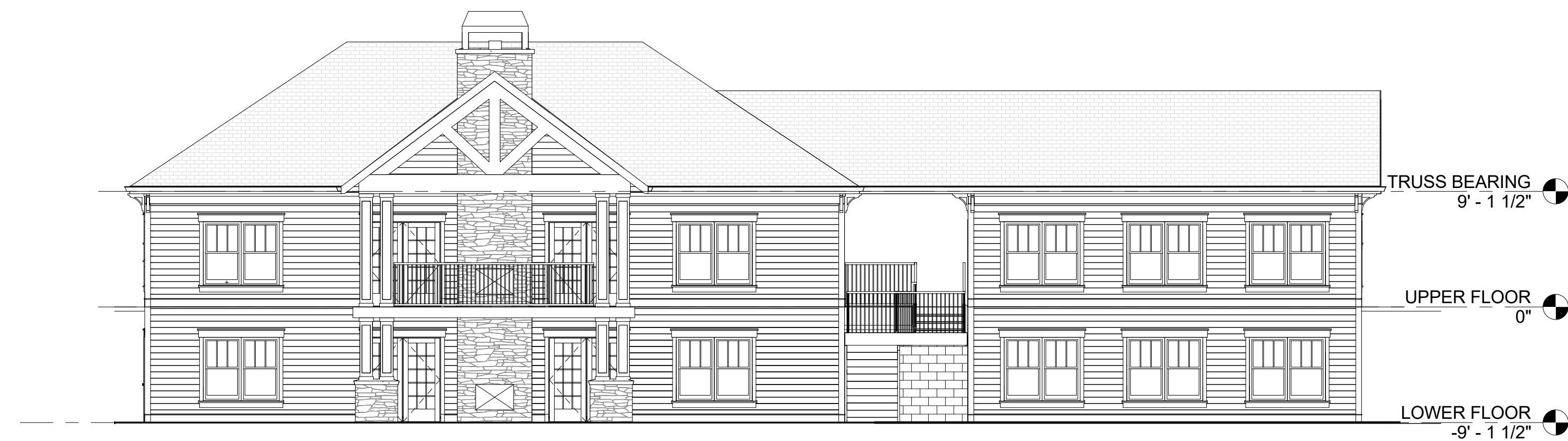
2 REAR ELEVATION SCALE 1/8" = 1'-0"